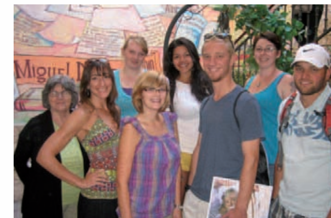
A group of students in Colegio Delibes