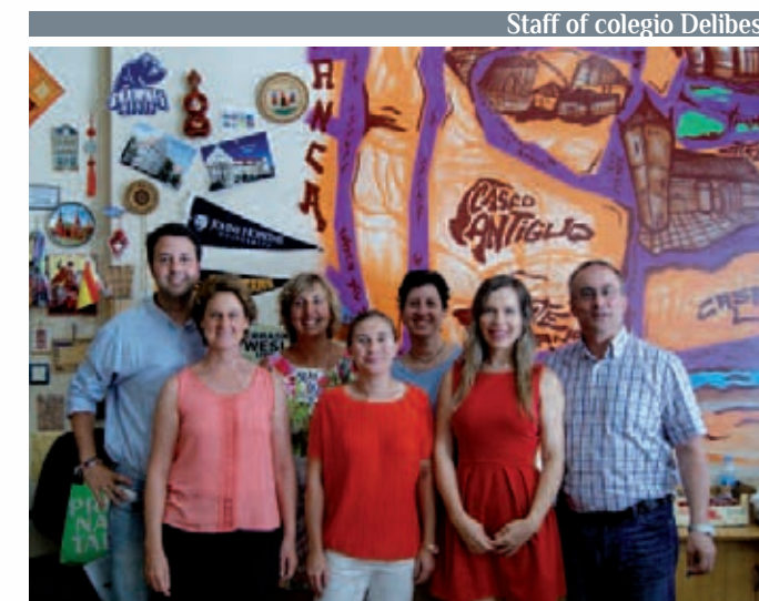
Staff of colegio Delibes

Note: The start date of each level (the first Monday of each month), is indicated in the registration form.