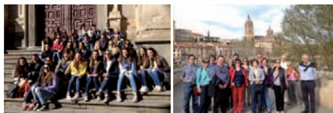
Cultural tour around the city