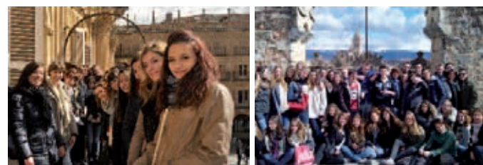
A group of students