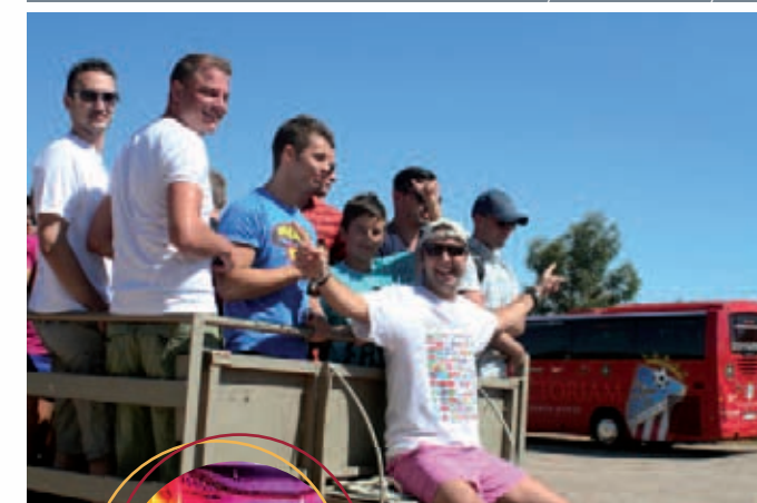
Party in the countryside