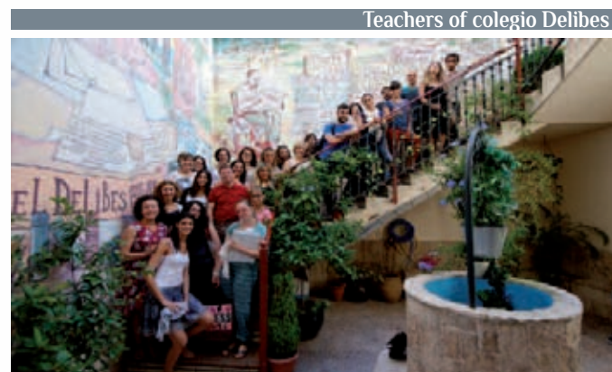
Teachers of colegio Delibes

Colegio Delibes is situated in a historical building, five minutes walk from the Plaza Mayor. It has been recently restored, and equipped with the latest technology; twenty six air-conditioned classrooms, a video and conference room, a library, a special kitchen for cooking lessons, and IT areas with free internet access and wi-fi. There is also an enclosed patio with a typical Castilian well where you can relax with a coffee and chat to other students during the breaks.