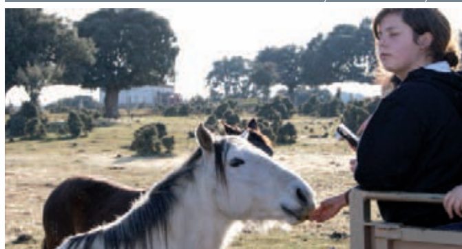
A day in the countryside